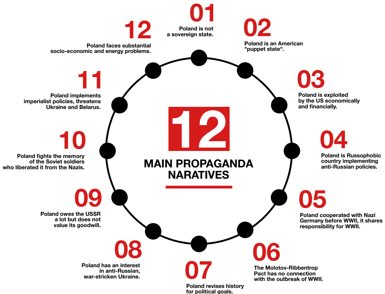
Graph 1. Twelve major disinformation narratives in Sputnik Poland, 2019-2020.

These narratives question the extent of Poland's sovereignty, point to the alleged Russophobia and anti-Ukrainian policies of Poland, and criticise Polish perspectives on historical events.